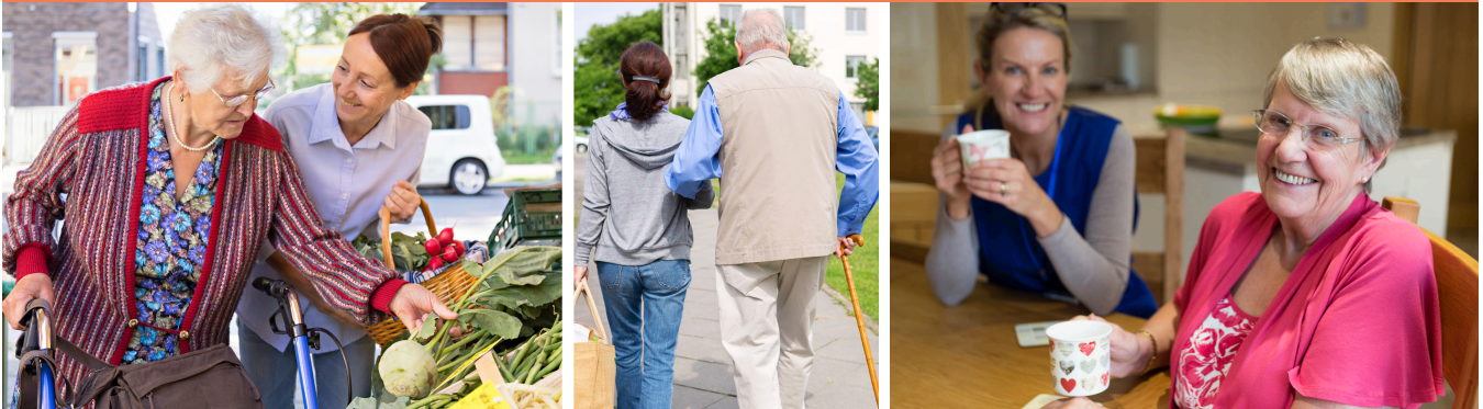
SUPPORTIVE CARE | COMPANIONSHIP/DEMENTIA SUPPORT