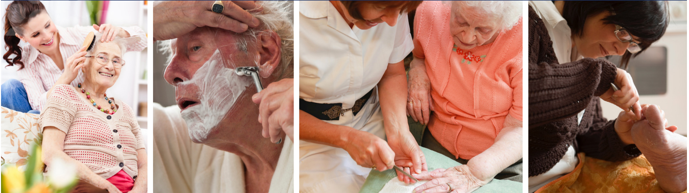
ASSISTED LIVING AT HOME | PERSONAL CARE